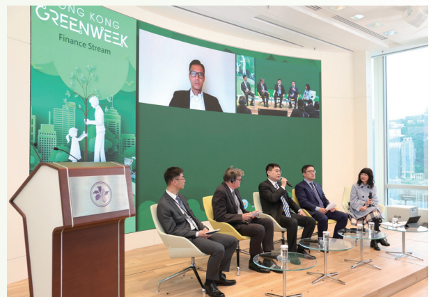
A panel discussion at the CBF